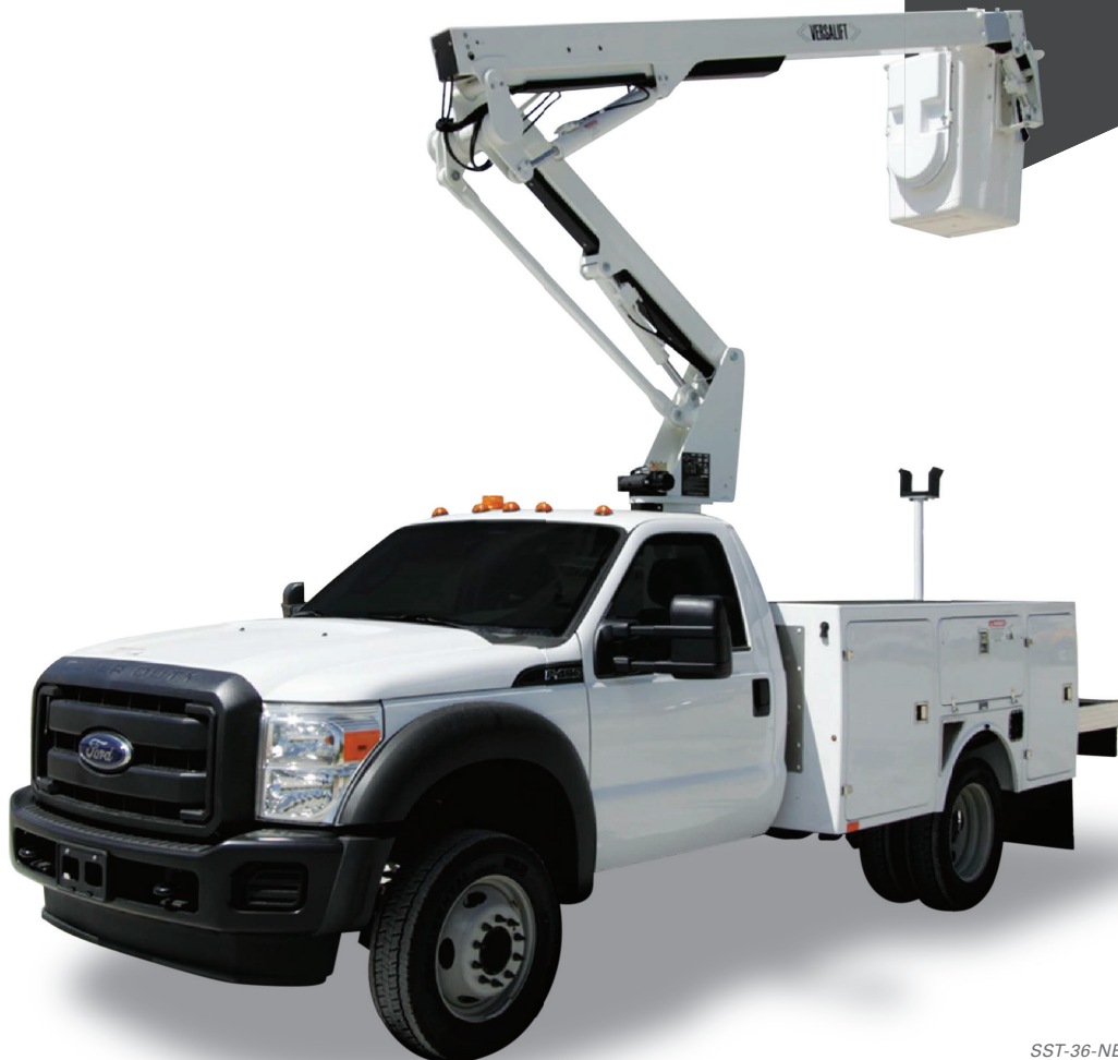
SST-36-NE shown with positioner.