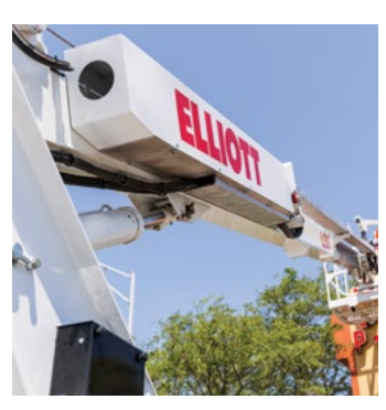
Oversized Cable Carrier Reliably carries hydraulic, electric, welding, oxy/ acetylene, air and other accessory lines to the work platform.

Elliott's 2,000 lb main winch option allows lifting loads with the work platform attached or removed, increasing lifting versatility.