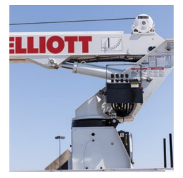
Material Handling Main Winch

Elliott's unique jib winch stows in the platform and features an extendable boom and mast to lengthen your reach and reduce setup times.